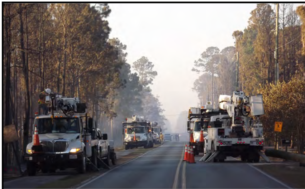
CHELCO crews worked through the night during the wildfires in May.

Dry weather and high winds created dangerous conditions for a fast-moving wildfire that swept through more than 600 acres and damaged or destroyed approximately 59 homes in Santa Rosa Beach in May, according to the Walton County Sheriff's Office.